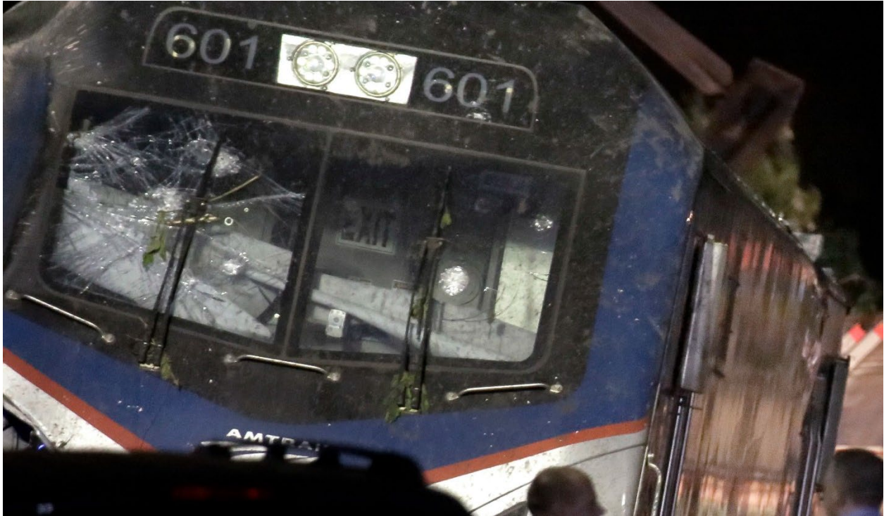
The locomotive of Amtrak Train 188 after it derailed.