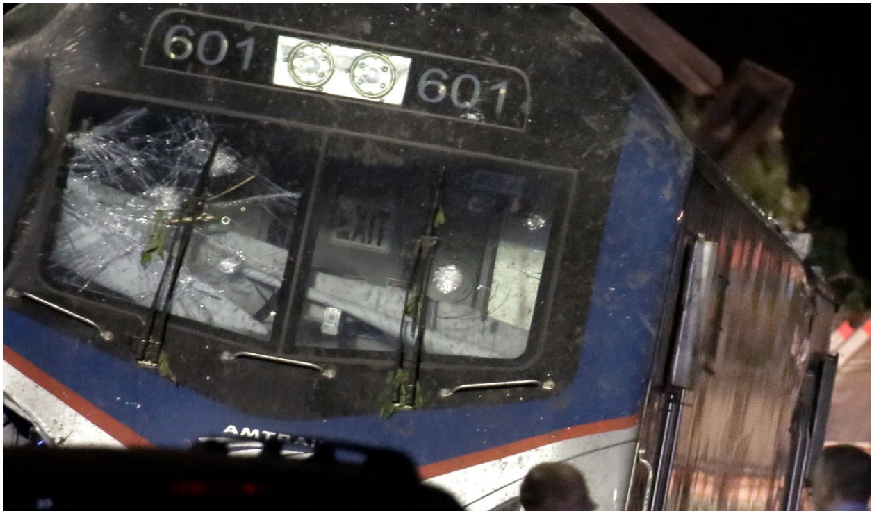
The locomotive of Amtrak Train 188 after it derailed.