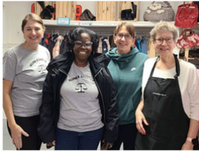
Center in Pitman, N.J.