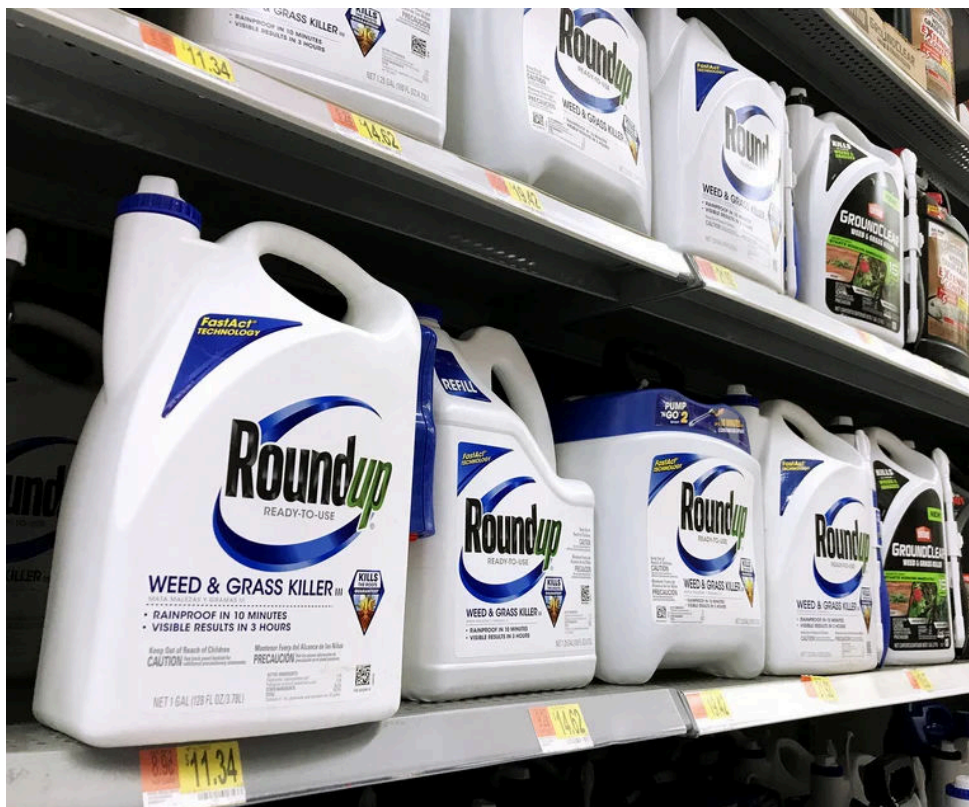
Roundup weedkiller on shelves at Walmart in Baltimore, MD.